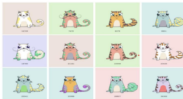
Examples of Cryptokitties.

The first application based on NFTs to reach widespread adoption was a virtual online game called CryptoKitties. The game took up more than 70% of the transaction capacity of the Ethereum network at one point and the most expensive NFT that represents ownership of such a cat was sold for over USD 100,000 in late 2017.