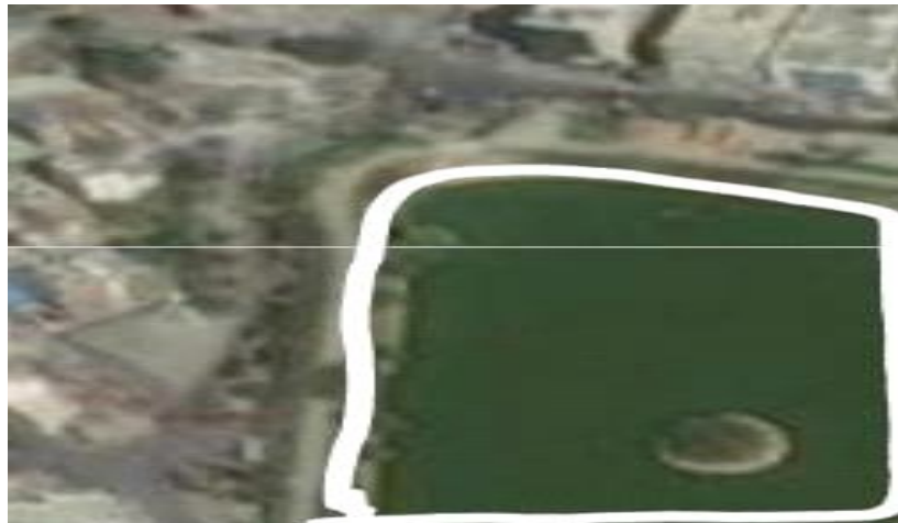
Fig 3.5: Yelachenahalli Lake (Northwest region), Bengaluru