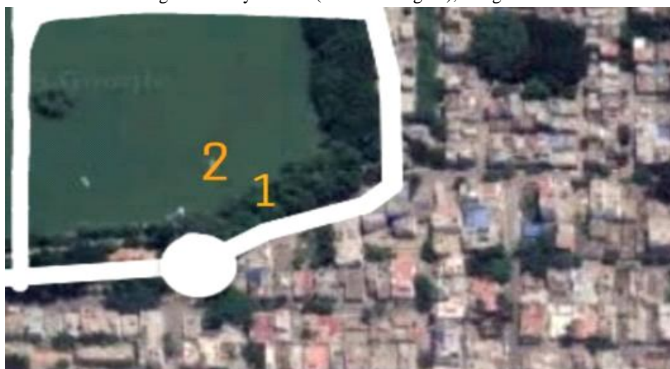
Fig 3.3: Two Sampling Locations in Yediyur Lake (South East Region), Bengaluru