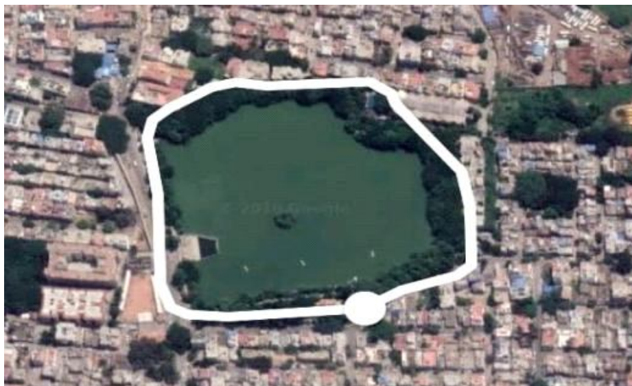
Fig 3.1: Yediyur Lake, Bengaluru