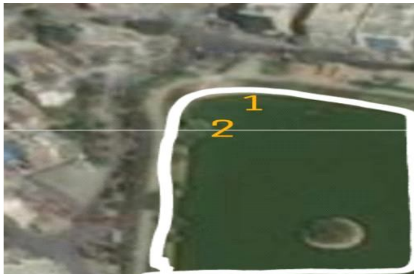
Fig 3.6: Two Sampling Locations in Yelachenahalli Lake (North West Region), Bengaluru