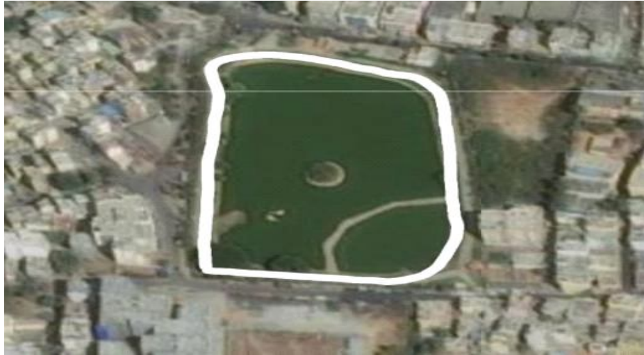
Fig 3.4: Yelachenahalli Lake, Bengaluru