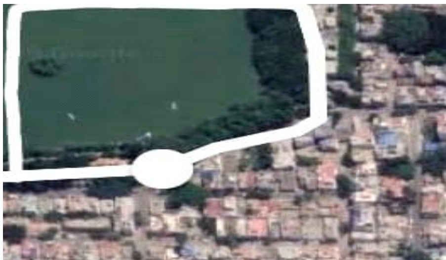
Fig 3.2: Yediyur Lake (Southeast region), Bengaluru