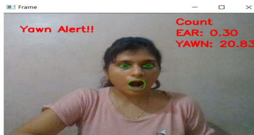
Fig.2 Implementation of Yawn detection