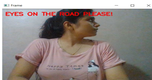
Fig.4 .Implementation of driver distraction.