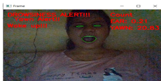
Fig.5.Drowsiness detection in low light