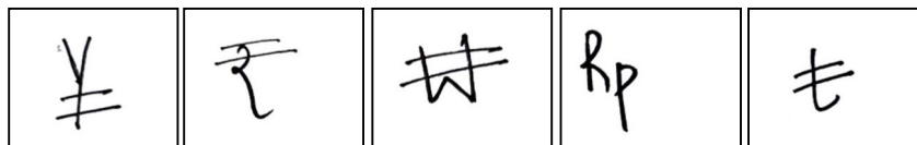
Fig. 1. Handwritten Currency Symbols