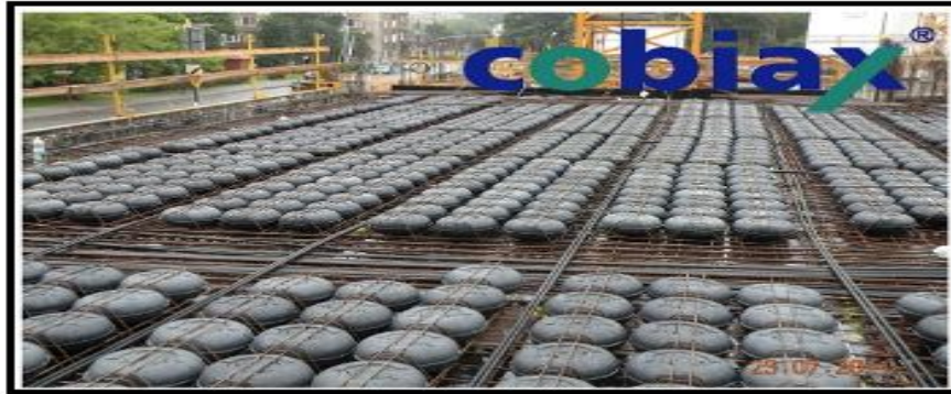
Fig. 2 Flat slab or Voided slab

Cobiax is a leading manufacturer providing services in voided slab technology based in USA. In India recently such techniques are being used as such method can give advantage of long span with exclusion of beams and having fire resistance of REI 180 rating. The main advantage of Cobiax system is reduction of concrete and steel in zone where positive bending moments are formed which minimize the unit weight causing less dead load of structure which provide benefit of higher stability. As there are no beams involved it can be used in shell or curved structure. Due to concrete cover of 3mm dead weight is dropped upto 30%. Thus direct loads on footings get reduced furthermore, giving more rigidity in same size of foundation. Cobiax are known for making eco-friendly components.