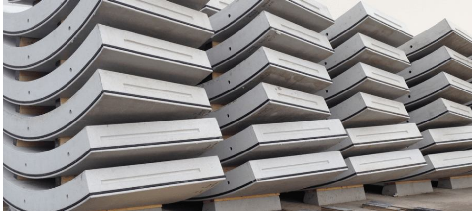
Fig. 3 Precast Members

Precast construction is being used in all over the world from few decades, in this method pre-designed molds were poured of site in a very controlled environment and the cured structural element will be transported to the site for erection of structure. Many government agency like MHADA and NHDA are using these system in urban region as space in such area are restricted special plant is need to be constructed for Precast members it removes the risk of being damaged or errors in dimension as components are manufactured in controlled environment. For multistory buildings as all members are already casted offsite it eliminate risk of accident which happens on high-rise concreting, such precasted elements don't have requirement of curing thus maximizing the speed of construction and timely completion of work. The precast method of construction is simultaneous work of transportation, stalk and then assembling but these requires the heavy machinery and multi-wheel cranes as in single day 20-25 structural elements can be constructed and result may vary according to availability of equipment and skilled human resources. These system can be expensive for small scaled infrastructure project as one has to setup complete plant for elements to be casted but for mega project as time is limited and margin for error is less this system could be utilized and for such project the time of completion can be reduced upto 20-25 % compared to convention method of construction