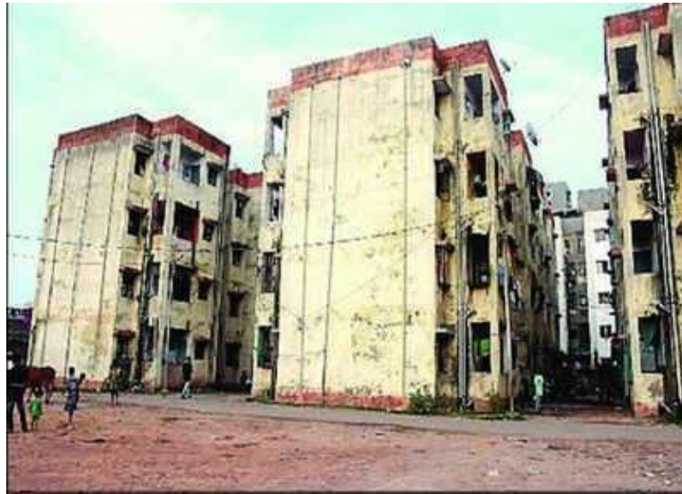
Fig. 4 Sample of scheme of UIT by HUDCO