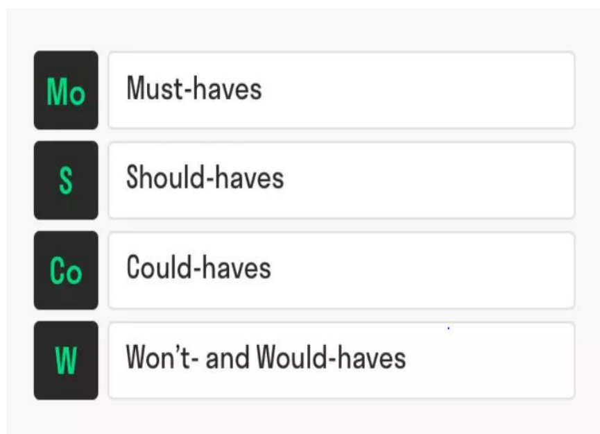
Fig. 1 MoSCoW Methodology

It is quite tempting for us to add a number of different tools and functionalities in our attempt to provide for the user but as pointed out by the survey, the applications which did this, became too cluttered and complex to use and thus failed to achieve their primary goal. We have adopted the MoSCoW method for the scope planning for this project which will help us in trimming down the scope for the preparation of an MVP (minimum viable product). Our main goal at this point is to release an alpha version of the application which will be made available to the user for free and will be used to gather data as feedback for the further iterations of the product.