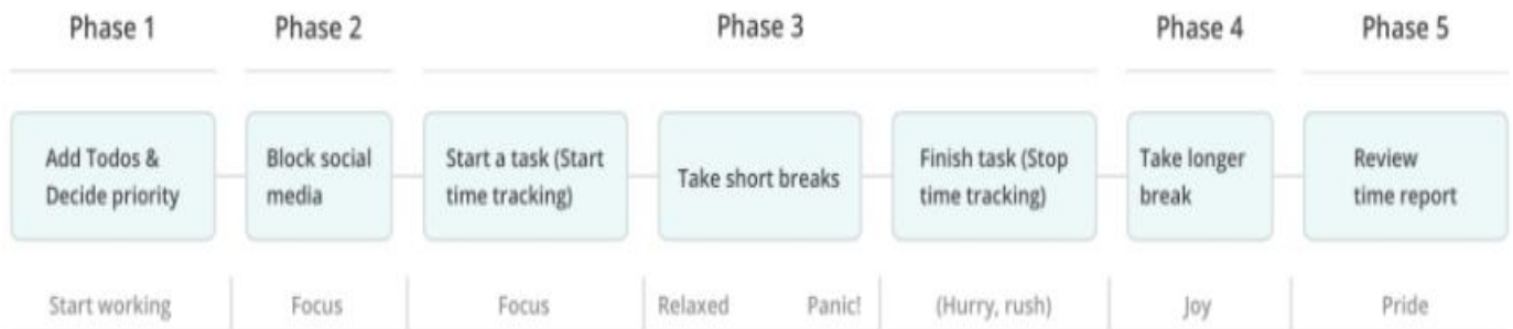
Fig. 2 Phase Map