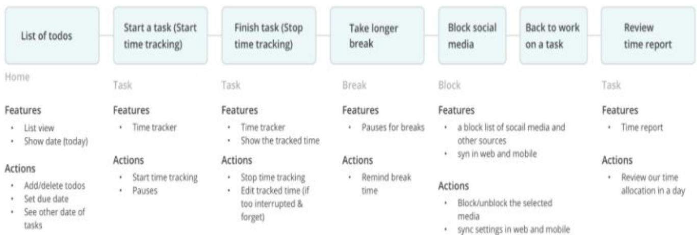
Fig. 3 Action Map

The site map is a high-level flow structure that depicts all the options the user will have while using the product, we have purposefully taken measures to not give the user too many tools and options as our survey showed that an excess of functionality has a counterproductive effect on the efficiency of the user.