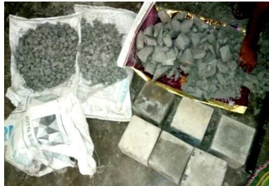
Fig. 2: Formation of geopolymer Coarse aggregate

2) Phase-II: Prepare Geopolymer Aggregate: Alkaline activator is ready for 10M by mixing of NaOH and Na 2 SO 3 with a water . Required quantity of the fly-ash and ore tailing was weighed. flyash and Iron ore taling has mixed with alkaline activator solution. Mixing was administered by hand with proper care and precaution. Prepared slurry was added to the moulds of 150mm side and therefore the cubes are allowed for the oven curing for 4 hours at 1000 C and demolded later. Those cubes are kept outside for every week to realize the strength during a dry climate then the aggregates prepared by crushing of the cubes after every week. Obtained the varied sizes of coarse aggregates. Those aggregates are used for the preparation of concrete.