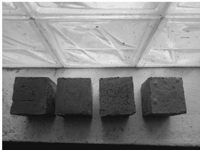
Fig. 1: 75mm cubes of different molarity