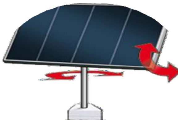
Fig.1 Dual axis solar tracker

Dual axis solar tracker has two degrees of freedom that act as axes of symmetry. The axes of dual solar tracker are accustomed normal to one another [5]. It can go round simultaneously in horizontal and vertical directions and are able to point at the sun at all times. Dual axis trackers track the sun both East to West and North to South direction for added power output (approx. 40% obtain) and expedience [4].