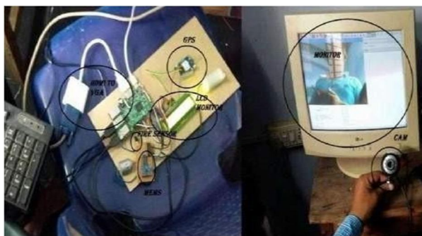
Fig.9: Hardware Arrangement

The Hardware arrangement of the —ANTI – SMUGGLING ALARMSYSTEM| is given below.