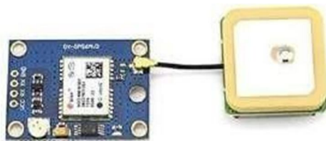
Fig.6: GPS Module

The NEO-6MV2 may be a GPS module, used for navigation. The module simply used to checks its location on earth and provides longitude and latitude of its position. it's from a family of stand-alone GPS receivers featuring the high performance u-blox 6 positioning engine. These flexible and price effective receivers offer numerous connectivity options during a miniature (16 x12.2x 2.4 mm) package. The Module architecture, power and memory options make NEO-6 modules ideal for battery operated mobile devices with very strict cost. Its Innovative design gives NEO-6MV2 excellent navigation performance even within the most challenging environments.