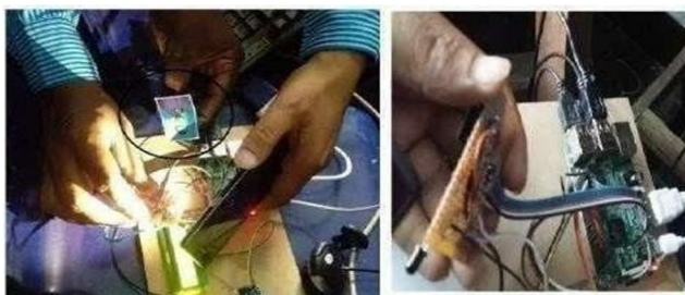
Fig.11: When the fire is NOT Detected, the Motor will OFF