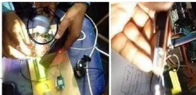
Fig.10: When the fire is detected, the Motor will ON