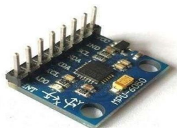
Fig.7: MEMS Sensor

Micro Electro-Mechanical Systems (MEMS) sensor consists of a 3-axis of Accelerometer and gyroscope. It used to measure acceleration, velocity, orientation, displacement and many other motion related parameter of a system. This module contains (DMP) Digital Motion Processor inside it which is powerful to interface external IIC modules like an magnetometer, however it is optional. Since the module MPU6050 are ADXL335 (3-axis accelerometer), ADXL345 (3-axis accelerometer), MPU9250 (9- axis IMU).