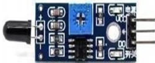
Fig.5: Fire Sensor

A fire/flame detector is a sensor designed to detect and respond the presence of a flame or fire. The Flame sensor is used to detect fire flames and detects the fire up to a range of 1 meter.