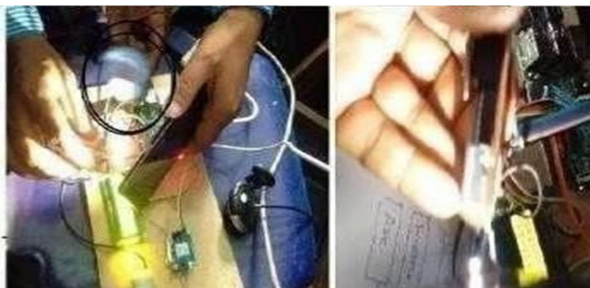
Fig.10: When the fire is detected, the Motor will ON