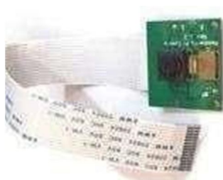
Fig.8: Pi Camera

The Pi camera module is portable light weight camera that supports Raspberry Pi. It used to communicate with Pi using the MIPI cam serial interface protocol. Normally, It is used in image processing, machine learning and surveillance projects. It is commonly used for surveillance in dronessince the pi cam is very less price. Apart from these , Pi can also be used as normal USB webcam that are used in computer.