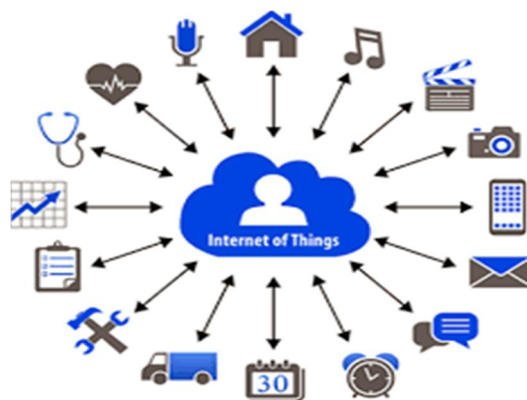
Fig.1: IoT Representation

The IoT permits objects to be perceived or controlled remotely across existing network infrastructure, making opportunities for additional direct integration of the physical world into computer- based systems, and leading to improved efficiency, accuracy and economic profit to boot to reduced human intervention. Once IoT is increased with sensors and actuators, the technology becomes associate instance of the additional general category of cyber- physical system, that conjointly encompasses technologies like sensible grids, virtual power plants, sensible homes and sensible cities. every issue is unambiguously known through its embedded automatic data processing system however is ready to interoperate among the present net infrastructure.