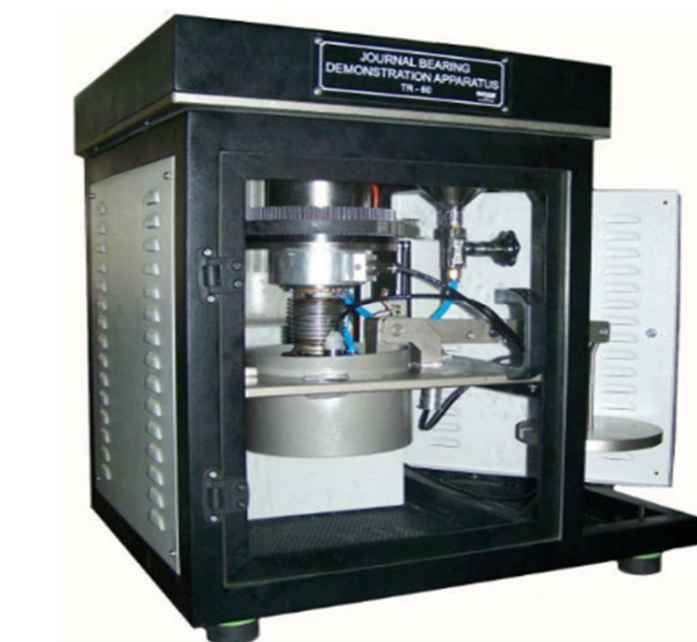
Fig 2 Journal Bearing Tester

Journal bearing tester machine is used to investigate pressure distribution of journal bearing in a lubricant under different load condition. For performing operations 3 litres oil must require. The maximum load applying capacity is 750 N and the maximum speed applying capacity is 2000rpm. The oil reservoir capacity of this machine is 500ml. It consists of a shaft which is mounted vertically and driven by variable speed motor. A metallic bellow connects brass bearing on the bottom and top is fixed to the frictional torque load cell. The bearing is made of brass material. A stepper motor moves the bearing in the direction of the rotation of the shaft onto 180 in steps of 9. A pressure sensor is fixed to the bearing, which measures the film pressure distributed in the oil film. The lever arm is used to apply radial load by dead weights. The assembly of the shaft and the bearing is immersed in oil, so as to provide continuous lubrication at all times. A controller is used to display the values of the angular position of pressure sensor with reference to the load line and the corresponding pressure values. The data obtained are transmitted to PC through data acquisition cable.