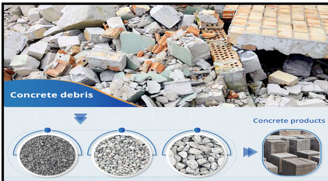
Figure: Production Of Concrete Blocks From Recycled Aggregate Concrete