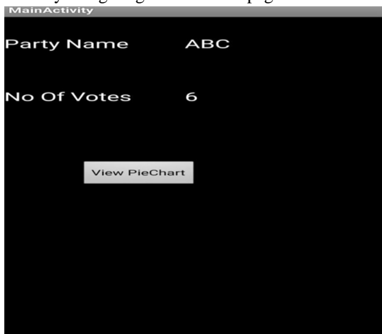
Fig 4: Results Page

The voter can view the results of the election by navigating to the results page