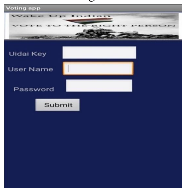
Fig 2: User Login Page

The user (voter) has to enter the Unique Id sent to his Email along with his Username and password to login to the system.