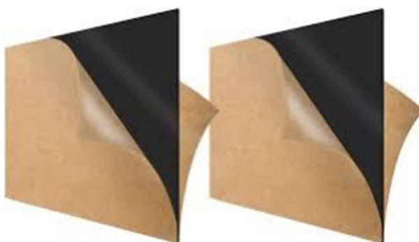
Figure 4. Acrylic sheets

UV-C light is a very energetic form of light that is not visible to the human eye. Based on our evaluation, UV-C light which is used for germicidal processes will not penetrate standard acrylic plastic sheets. The ability of UV-C light to penetrate materials will depend on the chemical composition of the materials. Most acrylic plastics will allow light of wavelength greater than 375 nm to pass through the material, but they will not allow UV-C wavelengths (100–290 nm) to pass through. Even very thin acrylic sheets of less than 5 millimeters (mm) do not let UV-C light penetrate. Therefore, you will be able to use standard acrylic plastic for your currency sanitizer equipment. Also, the ability of UV light to penetrate acrylic plastic is dependent on the chemical formulation.