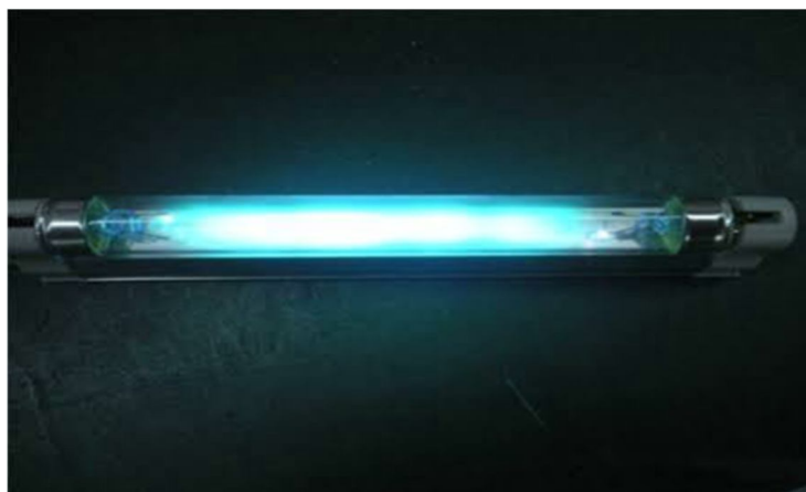
Figure 1. UV Lamp