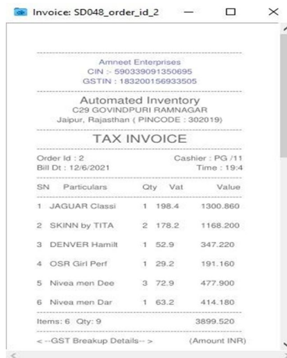
Fig. 3 Invoice

After the customer has successfully placed an order, an invoice will be generated automatically. Fig. 3 shows the invoice of selling products.