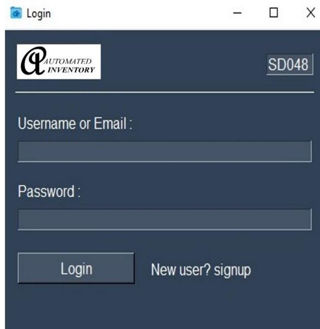
Fig. 1 Login form for automated inventory

A login form is used to authenticate users in order to secure the system from un-authorized access. Fig. 1 shows the login form for automated inventory.