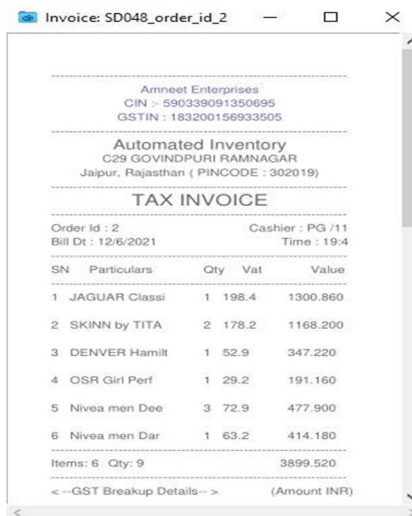
Fig. 3 Invoice

After the customer has successfully placed an order, an invoice will be generated automatically. Fig. 3 shows the invoice of selling products.