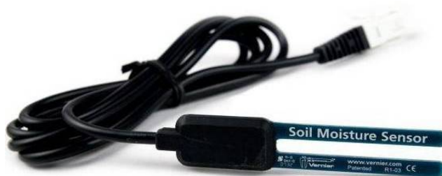
Figure 2: Soil Moisture Sensor

In agriculture, measuring soil moisture is critical for farmers to manage their irrigation systems. One solution is a soil moisture sensor. This sensor determines the amount of water in a container. The capacitance of a soil moisture sensor is used to determine the amount of water in the soil. This sensor is simple to use. Simply place this tough sensor in the soil to be tested, and the volumetric water content will be determined of the soil is reported in percent.