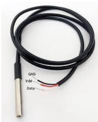
Figure 3: DS18B20 Digital Thermometer

The DS18B20 Digital Thermometer measures temperature in 9 to 12bit centigrade and includes a nonvolatile alarm function with user-programmable upper and lower trigger points. The DS18B20 connects with a central CPU using a 1-Wire bus, which requires just one data line (and ground) by definition. It can operate at temperatures ranging from 55°C to +125°C and is accurate to 0.5C over the range of 10C to +85C. . Furthermore, the DS18B20 can get power directly from the data line (parasitic power), removing the need for an additional power supply.