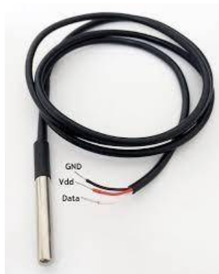
Figure 3: DS18B20 Digital Thermometer

The DS18B20 Digital Thermometer measures temperature in 9 to 12bit centigrade and includes a nonvolatile alarm function with user-programmable upper and lower trigger points. The DS18B20 connects with a central CPU using a 1-Wire bus, which requires just one data line (and ground) by definition. It can operate at temperatures ranging from 55°C to +125°C and is accurate to 0.5C over the range of 10C to +85C. . Furthermore, the DS18B20 can get power directly from the data line (parasitic power), removing the need for an additional power supply.