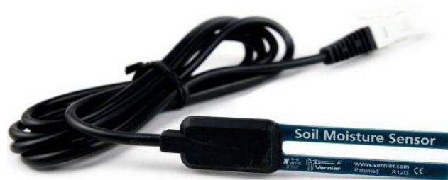
Figure 2: Soil Moisture Sensor

In agriculture, measuring soil moisture is critical for farmers to manage their irrigation systems. One solution is a soil moisture sensor. This sensor determines the amount of water in a container. The capacitance of a soil moisture sensor is used to determine the amount of water in the soil. This sensor is simple to use. Simply place this tough sensor in the soil to be tested, and the volumetric water content will be determined of the soil is reported in percent.