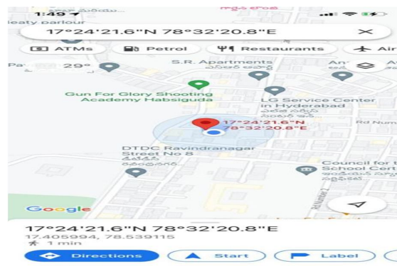
Fig 3. Google Map Location