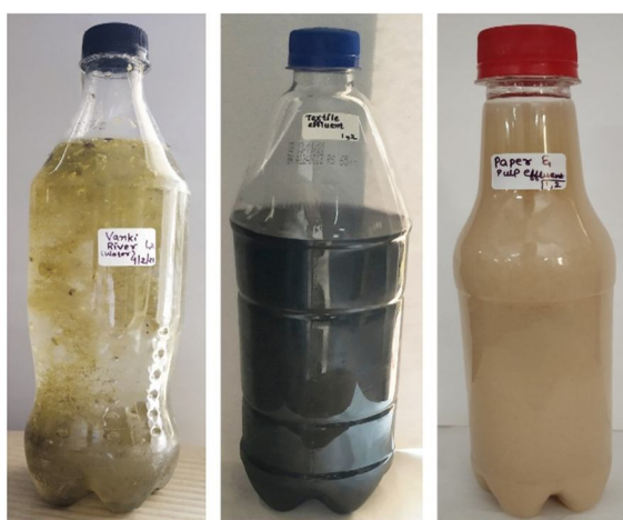
Fig. 1: Samples from Vanki river, Textile Industry and Paper & Pulp Industry

River water was collected from Vanki river, Valsad, Gujarat. Effluent samples of Textile industry and Paper & Pulp Industry were collected from Vapi, Valsad, Gujarat as shown in Fig. 1.