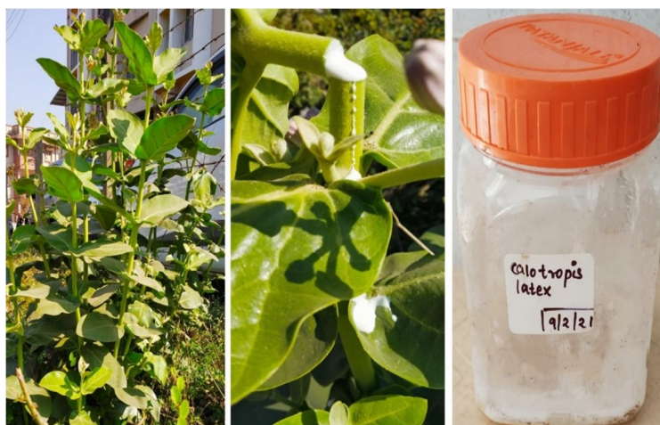
Fig. 2: Calotropis procera and its latex

Latex and leaves of Calotropis procera collected from Tithal road, Valsad, Gujarat is as shown in Fig. 2. Leaves collected from Moringa oleifera from Chhipwad, Valsad, Gujarat and its extract form is as shown in the Fig. 3.