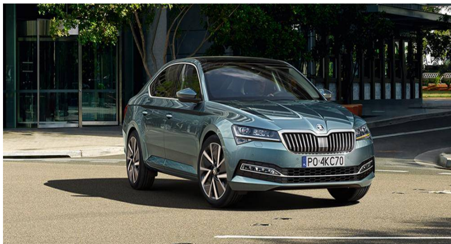
Figure 2: Car with a number plate