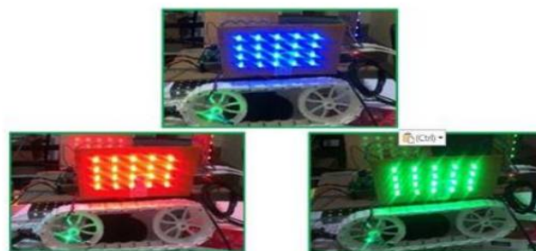
Fig 6 Camouflage technique

In defense areas, Robot are usually miniature in size so they are enough capable to enter in tunnels, mines and small holes in building and also have capability to survive in harsh and difficult climatic conditions for life long time without causing any