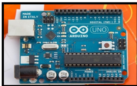
Fig. 1. Arduino UNO Board

Arduino ventures can independent or they can be associated with a PC utilizing USB. Arduino microcontroller is liable for controlling and interfacing between GPS module and GSM beneficiary. Arduino can detect the climate by accepting contribution from an assortment of sensors and can show and screen the sensor information. The Chronic Screen is essential for the Arduino IDE programming. Its responsibility is to permit both send messages from PC to an Arduino board (over USB) and furthermore to get messages from the Arduino.