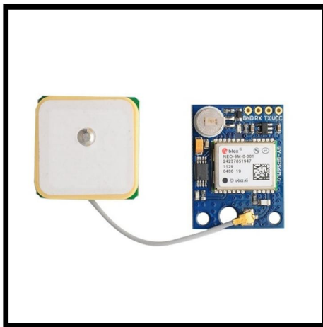
Fig.2. GPS Module

GPS represents Worldwide Situating Framework and used to recognize the Scope and Longitude of any area on the Earth, with precise UTC time (All inclusive Time Facilitated). GPS module is the principle part in our vehicle global positioning framework project. This gadget gets the directions from the satellite for every single second, with time and date. GPS module sends the information identified with following situation continuously, and it sends so numerous information in NMEA design. NMEA design comprise a few sentences, wherein we just need one sentence. This sentence begins from $GPGGA and contains the directions, time and other valuable data. This GPGGA is alluded to Worldwide Situating Framework Fix Information.