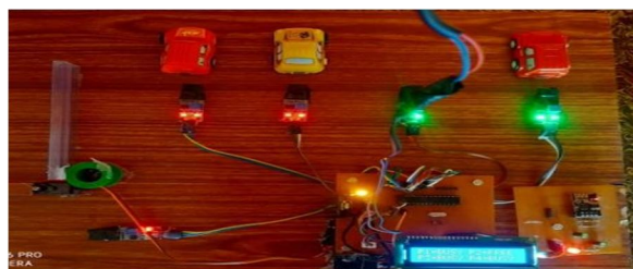
Figure 2: Result View of Smart Car Parking System Using IOT