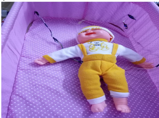
Fig. 1 Top view of the model

The designed system will be a great help for parents. Various sensors and actuators are used to ensure baby's safety. This system can also be implemented in hospitals. This is an user-friendly system. Baby can get better attention with this system. It can help improve the quality of infant care system. GSM based baby monitoring and automatic swing system is inexpensive and simple to use. This system emphasizes the importance of kid care.