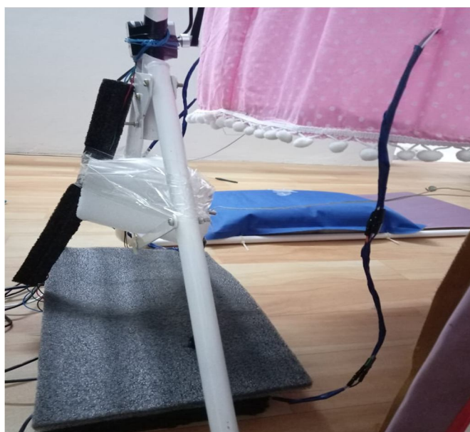
Fig. 2 Side view of the model