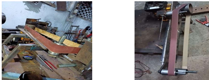
Figure 2 Assembly and Testing