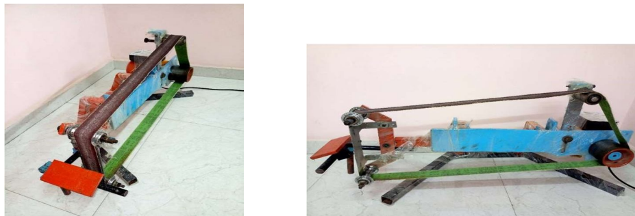
Figure 4 Final Model

We have designed model such that the worktable can move freely in any angular requirement thus providing flexibility in operation, large work piece can be easily grind which may be either vertical or horizontal, there is uniformity in grinding surface obtained providing accuracy of work piece, there is very less chance of slippage of work piece as there is firm gripping on work piece due to flexible worktable.