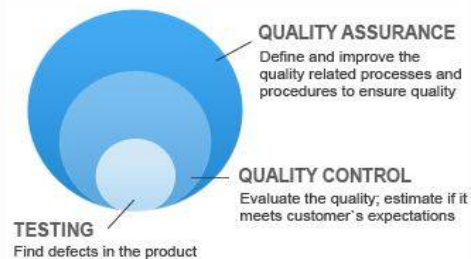
Figure1. Software Quality Assurance [9]

It can be suitably defined as a set of organized activities which provide proof of the ability of a software process to generate a software product which is suitable to use [3].