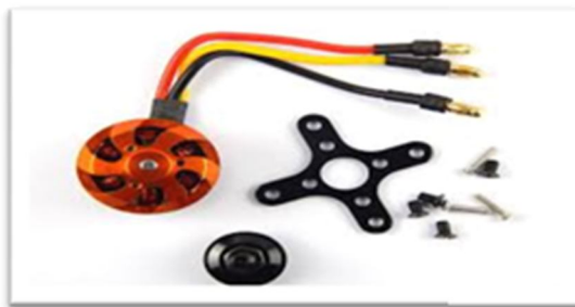
Figure 1) Rotors or Motors

The brushless motors do not have a brush on the shaft which takes care of switching the power direction in the coils, and that's why they are called brushless. Instead the brushless motors have three coils on the inner (center) of the motor, which is fixed to the mounting. Brushless motors spin in much high speed and use less power at the same time. Also they don't lose power in the brush transition like the DC motors do, so its more energy efficient.