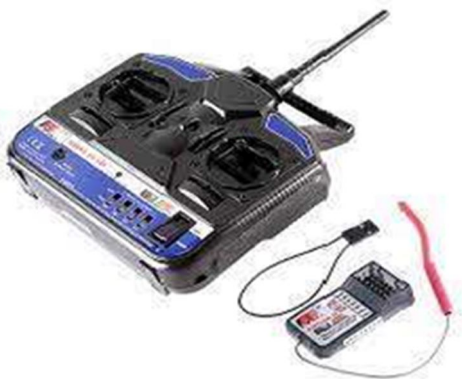
Figure 6) Radio Transmitter And Receiver