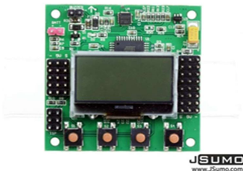
Figure 3) Flight Controller

4) Flight Controller: The flight controller board is regarded as the brain of the quadcopter. It houses sensors such as the gyroscopes and accelerometers that determine how fast each of the quadcopter's motors spin. Flight control boards range from simple to highly complex. An affordable, easy to set up, having a strong functionality controller is always recommended. Such controllers can handle about any type of multirotor aircraft.