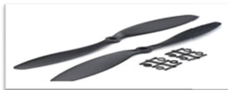
Figure 5) Propellers