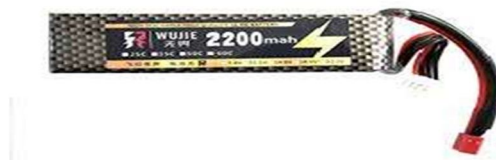
Figure 2) Battery

3) Battery- Power Source: 2200 mAH Li-po(Lithium Polymer) battery is used because it is light. NiMH(Nickel Metal Hydride) is also possible. They are cheaper, but heavier than LiPo. LiPo batteries also have a C rating and a power rating in mAH. The C rating describes the rate at which power can be drawn from the battery and the power rating describes how much power the battery can supply.