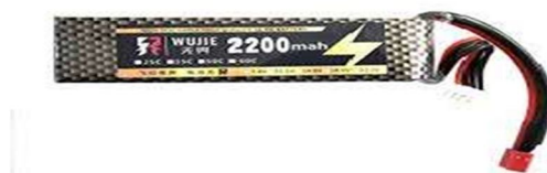
Figure 2) Battery

3) Battery- Power Source: 2200 mAH Li-po(Lithium Polymer) battery is used because it is light. NiMH(Nickel Metal Hydride) is also possible. They are cheaper, but heavier than LiPo. LiPo batteries also have a C rating and a power rating in mAH. The C rating describes the rate at which power can be drawn from the battery and the power rating describes how much power the battery can supply.