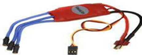
Figure 4) Electronic Speed Controller