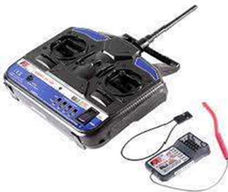
Figure 6) Radio Transmitter And Receiver