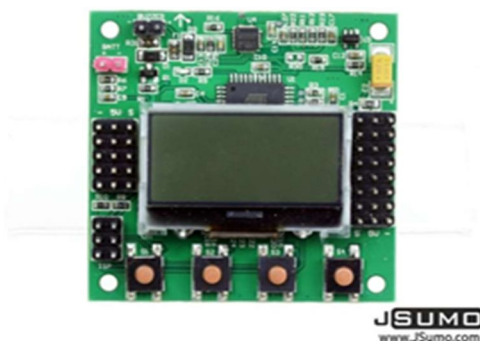
Figure 3) Flight Controller

4) Flight Controller: The flight controller board is regarded as the brain of the quadcopter. It houses sensors such as the gyroscopes and accelerometers that determine how fast each of the quadcopter's motors spin. Flight control boards range from simple to highly complex. An affordable, easy to set up, having a strong functionality controller is always recommended. Such controllers can handle about any type of multirotor aircraft.