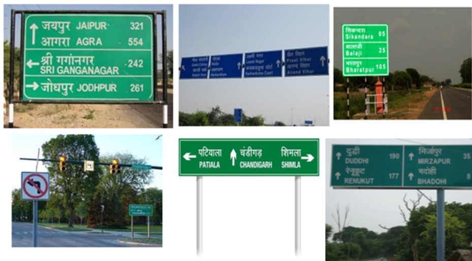
Fig. 2 Traffic Signboards

Detail explanation of these two stages is given in next sections.