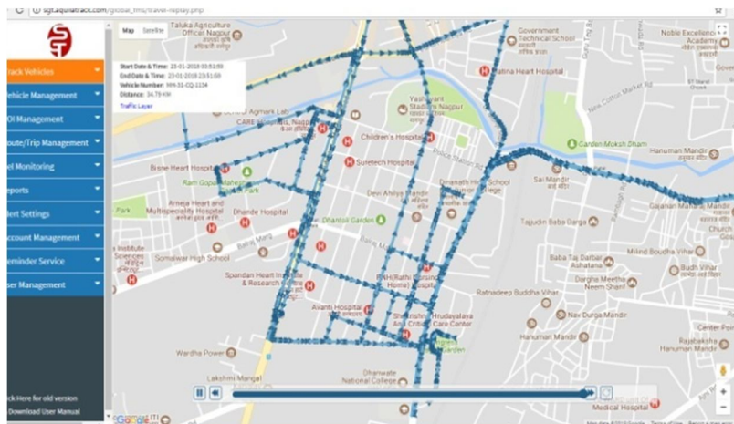
Image 2: GIS based route map of waste collecting vehicle

As there was no proper segregation, no specific treatment and disposal methods could be followed and waste was directly dumped into the dumpyard. From the above results, it was clear that a considerable large quantity of waste was generated from Dhantoli and a decentralized method of treatment and disposal of MSW was necessary.