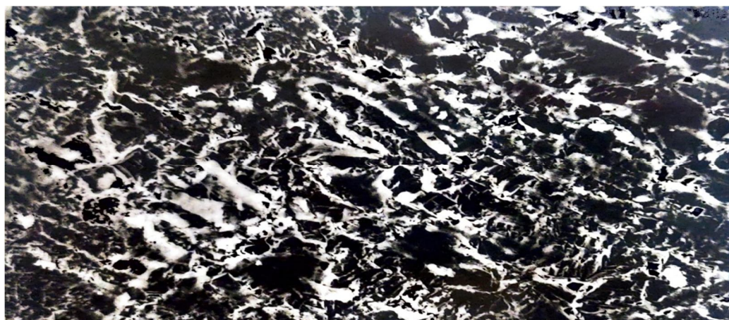
Fig. 1(a) SEM Micrograph of 304 Stainless Steel surface exposed to 1.0 M Sulphuric Acid solution for 12 hours. (X800)

Fig. 1(a) shows the Scanning Electron Microscope (SEM) of 304 stainless steel surface exposed to 1.0 M sulphuric acid solution for 12 hours and Fig. 1(b) in presence of 200 ppm of inhibitor. Fig. 1(a) clearly indicated that 304 stainless steel surface is severely corroded in the absence of the inhibitor. It is obvious from the Fig. 1(b) that the surface of 304 stainless steel in the presence of inhibitor is in much better condition than in absence of inhibitor. This indicates that Henna leaves extract is adsorbed on 304 stainless steel surface and the adsorbed film of the inhibitor provides corrosion resistance to 304 stainless steel in 1.0 M sulphuric acid solution.