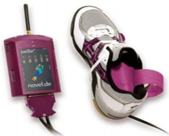
Figure 2. An in-shoe based foot planter pressure sensor by Pedar© Novel [1]

These sensors are flexible and placed in the shoe such that measurement reflects the combine between the shoe and the foot. This system is flexible and portable which allow a large variety of studies with different foot wear designs. These are most required for study of footwear design and orthotics but in this type of system there is a possibility of sensor slipping. For the accurate and reliable result sensor should be secured to prevent slippage.