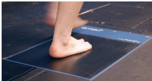
Figure 1. A platform-based foot planter pressure sensor emed® by Novel [1]

Platform systems are made from a flat, rigid array of pressure sensing elements arranged in a matrix configuration in the floor to allow normal gait. Platform systems are used for static and dynamic studies. This system is easy to use because it is stable and flat. The disadvantage of this system is that the patient need to clear that he has natural gait problem. For the accurate reading it is necessary for the foot to contact the centre of the sensing area.