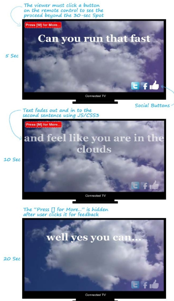
FIG. 3 30-SEC SPOT IN HTML5

Overall, the system runs smoothly on all the test devices. It worked at its best on the Chrome HTPC since this