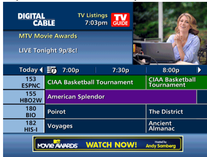
FIG. 1 INTERACTIVE GUIDE BANNER

Interactive TV ad has Entry Point and Landing page as two main parts which is similar to commercial TV. Entry Points are the place within the TV viewing or interactive experience where the viewer is first exposed to the interactive advertisement.