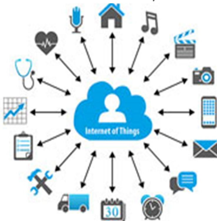
Types of security threats