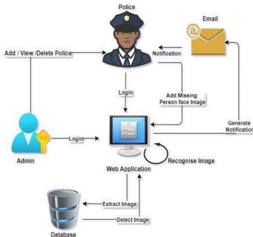
Fig. 1. Working Structure

Camera or CCTV face detection to match face features. To address identity we use the Line edge map algorithm. In these facial recognition we use a visual and visual library that can be easily integrated into the app.