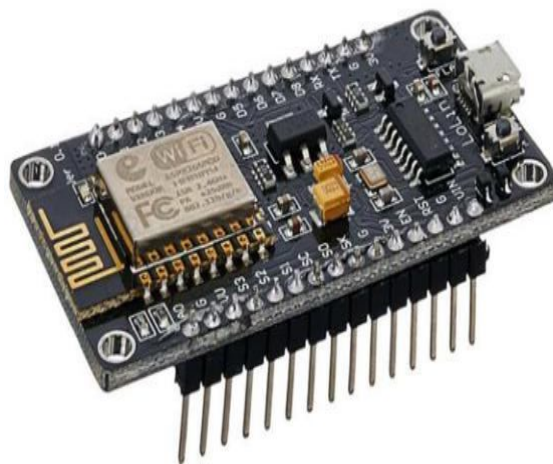
Fig. 1. NodeMCU ESP8266

NodeMCU is an open-source Lua based firmware and development board specially targeted for IoT based Applications. It includes firmware that runs on the ESP8266 Wi-Fi SoC from Espressif Systems, and hardware which is based on the ESP-12 module. It works as a main brain which controls all the hardware component with the help of software. In this project NodeMCU ESP8266 has following specification Microcontroller: Tensilica 32-bit RISC CPU Xtensa LX106, Operating voltage: 3.3V, Input voltage: 7-12V, Digital I/O pins(DIO): 16, Analog input pins(ADC): 1, UARTs: 1, SPIs: 1, I2Cs: 1, Flash memory: 4 MB, SRAM: 64 KB, Clock Speed: 80 MHz, PCB Antenna.