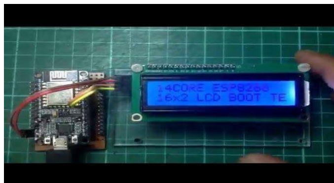
Fig. 5. Circuit diagram of proposed model

One of the major cause of unemployment is not finding the jobs. So to overcome this the jobs will be posted on the site and it will also help the admin to reduce the workload by using the device which we have created which will indicate the job posting and admin will not have to check on the system continuously. By the help of LCD module it can be implemented on the bigger level in public places to show vacancies which are open for job. It will help the needy who is in search of job as well as will save the time of people to search for job here and there.