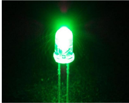
Fig. 2. LED

LED known as Light emitting diode. It is a semiconductor light source that emits light when current flows through it. Electrons in the semiconductor recombine with electron holes, releasing energy in the form of photon. In this project, LED is used as indicator which blinks when NodeMCU gets response from the server of the data entry. LED is connected with the resistor in series to prevent it from the overload and it works properly. It is connected to the D0 of the NodeMCU ESP8266.