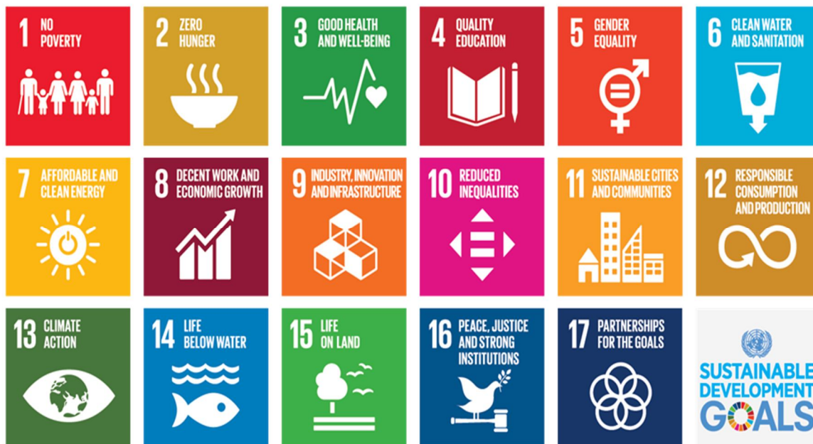
17 Goals of Sustainable Development Created by the UNESCO

I think sustainable development cannot be achieved without values because after completing of the refresher course and listening many resource parsons with great knowledge on various aspect of sustainable development, and read many books, reports, articles/papers on sustainable development, I reached this conclusion that all types of development including sustainable development are jointly related with human behaviour.