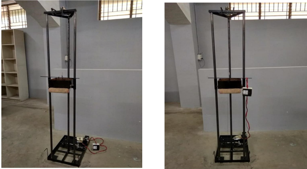
Figure.2 painting machine