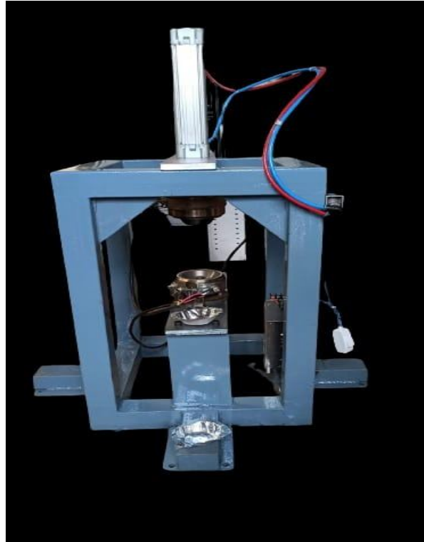
Figure 3 :- final model