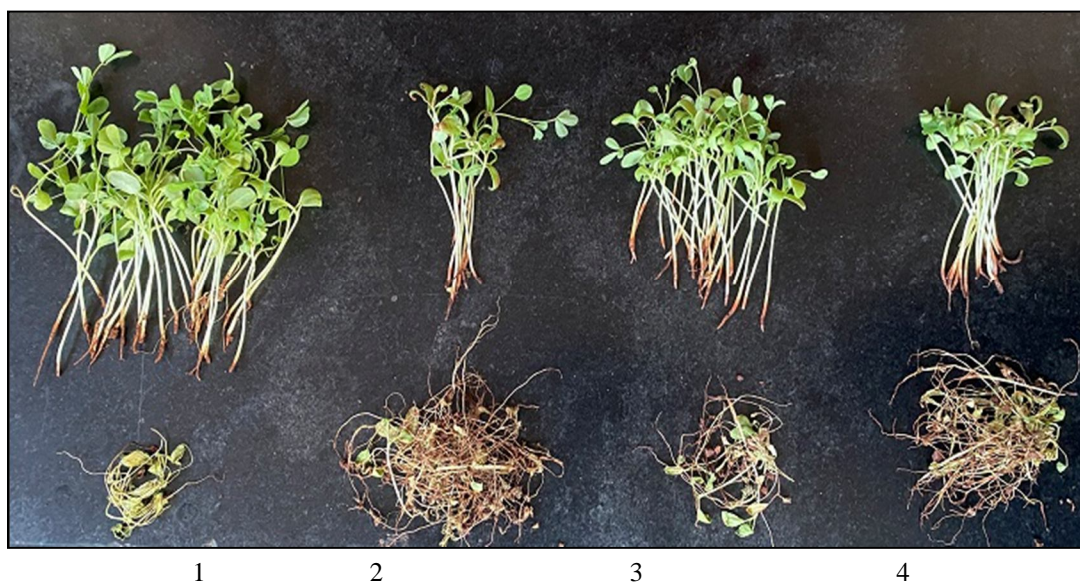
Figure 2: comparing healthy and dead plants on the final growth where 1) agricultural soil, 2) mined soil, 3) mined soil with biosurfactant and 4) mined soil with spent wash.

From the above image we can observe that application of seeds directly to the mined soil has resulted in the poor growth of plants where dead plants are more than the healthy ones. In case of mined soil mixed with the spent wash have slight good results than the only mined soil but not as good as agricultural soil and mined soil with bio-surfactant. It was observed that mined soil with bio-surfactant has complimentary results and has almost good yield as agricultural soil. From the present study we can note that abandoned mined soil can be reclaimed by best use of mined soil in bio-surfactant. There are several studies on the reclamation of abandoned mine soil using bio-surfactant, some of the reviews and articles in [17] - [19] are related to the present study.