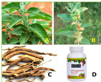
Fig. 1: Plant (A) with fruits (B), roots (C) and marketed formulation (D).

Whole plant, roots, leaves, stem, green berries, fruits, seeds, bark are used as a crude drug for various purpose (Fig. 1) [35].