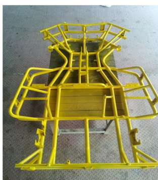
Fig. The fabricated chassis after painting