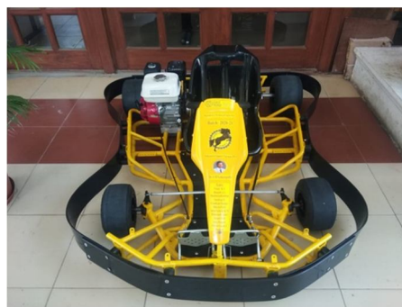
The finished go-kart

Also, from calculations and surveys, we got to understand that AISI 1018 is one of the best materials that can be used to give better performance.