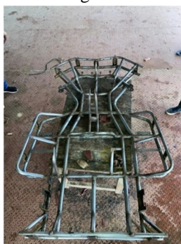
Fig.3. The fabricated chassis before painting

Once the design and analysis were done, the raw material was purchased and was fabricated according to the need. The welding process used for welding the chassis is Tungsten Inert Gas Welding.