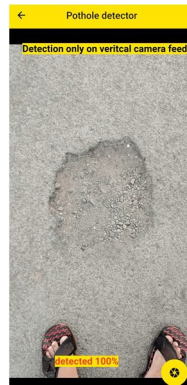
Fig. 3. Live pothole detection using App

The Fig-3 shows the self-captured image from the streets of Mumbai containing potholes which are combined with the available pothole dataset as shown in Fig-4 to give the dataset a wide spectrum of images. To make the dataset unique and versatile, web scraping is performed. Using various keywords for search, 1000 images were extracted. But, since searches using different keywords provide the same images sometimes, manual identification and removal of such images were performed. The scraped images were merged with the dataset. A label image was used to label the potholes from images according to the YOLO requirements.