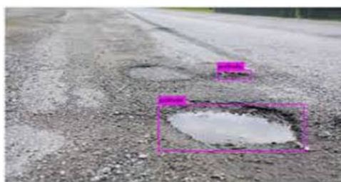
Fig. 5. Pothole labelling using OpenCV