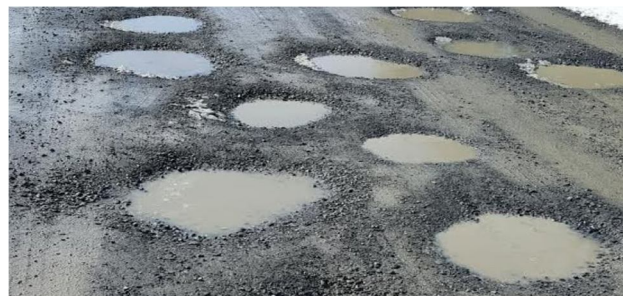
Fig. 4. Image from available Dataset

The Fig-3 shows the self-captured image from the streets of Mumbai containing potholes which are combined with the available pothole dataset as shown in Fig-4 to give the dataset a wide spectrum of images. To make the dataset unique and versatile, web scraping is performed. Using various keywords for search, 1000 images were extracted. But, since searches using different keywords provide the same images sometimes, manual identification and removal of such images were performed. The scraped images were merged with the dataset. A label image was used to label the potholes from images according to the YOLO requirements.