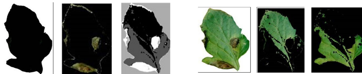
Figure 3: An example of output of K-means Clustering for a leaf infected with early scorch disease. (a)The infected leaf picture. (b, c, d, e) the pixels of the first, second, third & fourth cluster respectively & (f) a single gray-scale image with the pixel colored based on their cluster index.

The level to which the region is conveyed relies upon the issue being addressed. That is, division should stop when the object of interest in an application have been secluded. For instance:, in the computerized examination of electronic congregations, interest lies in breaking down pictures of the items with the goal of deciding the presence or nonattendance of explicit inconsistencies, for example, missing segments or broken association ways. There is no reason for conveying division past the degree of detail needed to distinguish those components. Division calculations for monochrome pictures for the most part depend on one of two essential properties of picture power esteems: intermittence and closeness. K-implies grouping is a strategy for vector quantization, initially from signal preparing, that is famous for bunch examination in information mining. K-implies grouping intends to segment n perceptions into k bunches in which every perception has a place with the bunch with the closest mean, filling in as a model of the group.