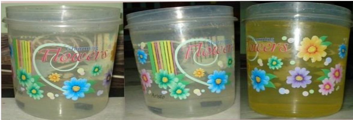
Fig. 2 quenching mediums

Eight samples from each grade were taken in a batch. The samples were kept inside the muffle furnace for three different durations 30 min, 60 min and 90 min at 850°C. Two of each sample was quenched in four different quenching mediums i.e. water, oil (Quenching oil-11), brine (ratio of 125 gm salt + 500 ml water) and air. After 15 minutes, the steel samples were taken out from quenching bath and cleaned by cloth. Then the hardness of those samples were measured at five different locations and average of them was taken. Finally the comparison was shown between the hardness values of all quenching mediums.