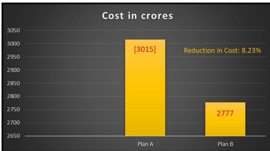
Fig 1. Cost reduction