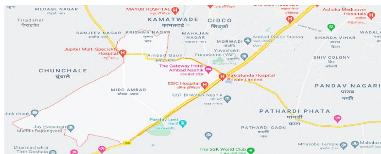
Fig 2.1 location of Ambad MIDC

MIDC Ambad is a small suburb in Nashik, a historic city in northern Maharashtra around 190 kilometres north of Mumbai, the state capital. The MIDC Ambad campus is located southwest of the city centre. Taking Route 3 from the city centre, it takes only 15-20 minutes to get to the district. Siemens has a major office in MIDC Ambad.