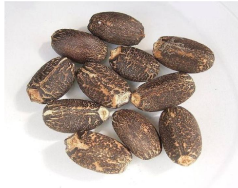
Fig. 1 Jatropha Plant [8]