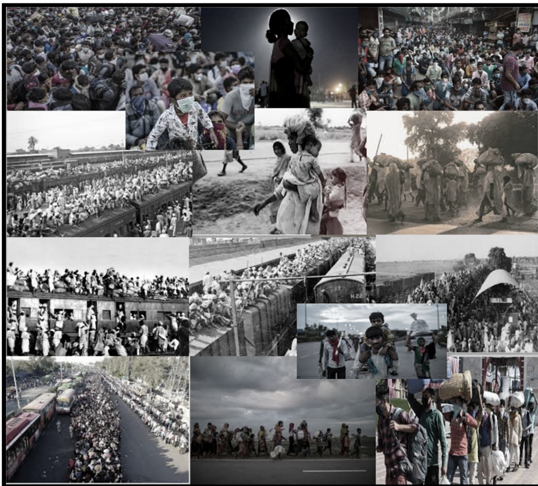
Figure 3: A collage of migration in India in 1947 during partition and 2020 during COVID 19 pandemic

A few states, most notably Kerala did a stellar job in protecting the rights and dignity of migrant labourers by arranging for food in community canteens, shelter and medical facilities trying their best to insulate them from the COVID outbreak while also arranging for special trains for the workers who wished to go back to their native places [67], [68].