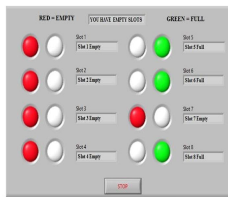
Figure 2: NI LabVIEW front panel design

The case loops in LabVIEW are verified and checks whether the slots are empty or not. If the slot is empty text message with empty slots are available and red led will glow. If some slots are filled, then the filled slots are indicated with green colour. If the entire slots are full a text message with no empty slots available will be displayed and green LEDs will glow which is shown in Figure2.