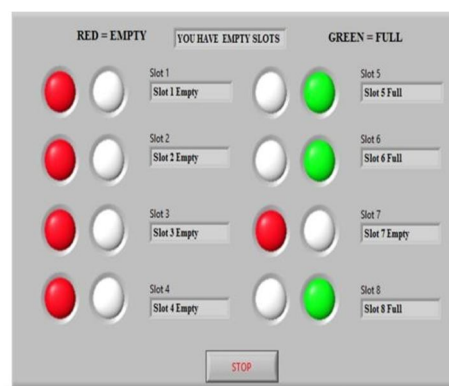
Figure 2: NI LabVIEW front panel design

The case loops in LabVIEW are verified and checks whether the slots are empty or not. If the slot is empty text message with empty slots are available and red led will glow. If some slots are filled, then the filled slots are indicated with green colour. If the entire slots are full a text message with no empty slots available will be displayed and green LEDs will glow which is shown in Figure2.