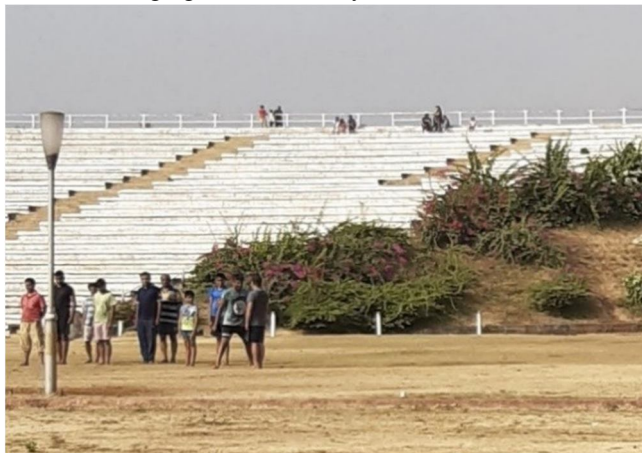
Fig. 4 Socialising at OAT; Central Park, Kharghar

Many cultural events have been hosted in the OAT of the park (Fig 4). The residents of Kharghar feel this is the cultural focal point of the zone and acts as an important factor in bringing the community closer.