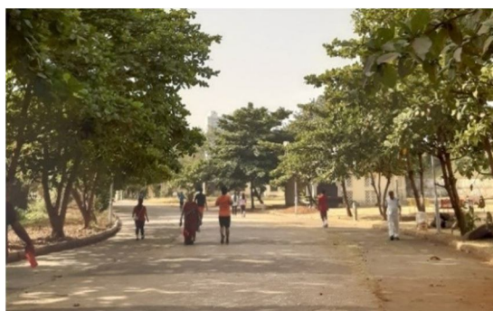
Fig. 3 Primary Pathway; Central Park, Kharghar

The visitors were seen to prefer the open areas with less vegetation as too much vegetation blocks the view and lost sense of uneasiness.