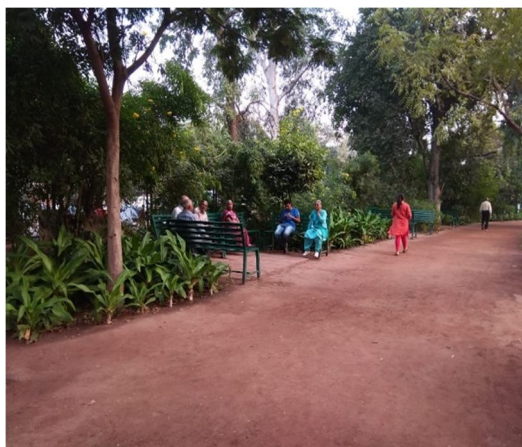
Fig. 9 Senior Citizens socialising; Parimal Garden, Ahmedabad

The clusters of the senior citizen were recognized predominantly near the entrance. When asked reason they mentioned it eases their access to the gates and reduces their travel time. This is a user group seen to spend time over 1 hour in the garden, seen reconnecting with friends (Fig 9).