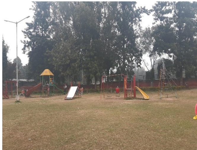
Fig. 7 Children Play Area; Nehru Park, Chandigarh

The community parks in both cities have similar functions and impacts on the neighbourhood. The final park studied is Parimal Garden in Ahmedabad. This is an urban park similar to Central Park. But Ahmedabad lacks a proper hierarchy of informal spaces, unlike planned cities but it does have many urban parks and open spaces. Ahmedabad is a result of Urban Sprawl; thus, the type of spaces differs from planned cities.