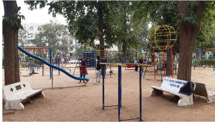
Fig. 8 Children Play Area; Parimal Garden, Ahmedabad

The clusters of the senior citizen were recognized predominantly near the entrance. When asked reason they mentioned it eases their access to the gates and reduces their travel time. This is a user group seen to spend time over 1 hour in the garden, seen reconnecting with friends (Fig 9).