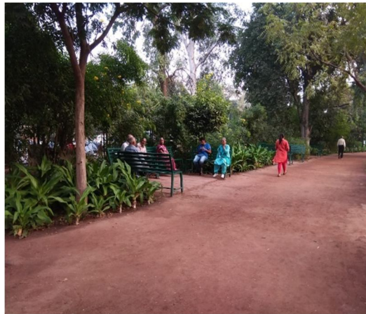
Fig. 9 Senior Citizens socialising; Parimal Garden, Ahmedabad

The clusters of the senior citizen were recognized predominantly near the entrance. When asked reason they mentioned it eases their access to the gates and reduces their travel time. This is a user group seen to spend time over 1 hour in the garden, seen reconnecting with friends (Fig 9).