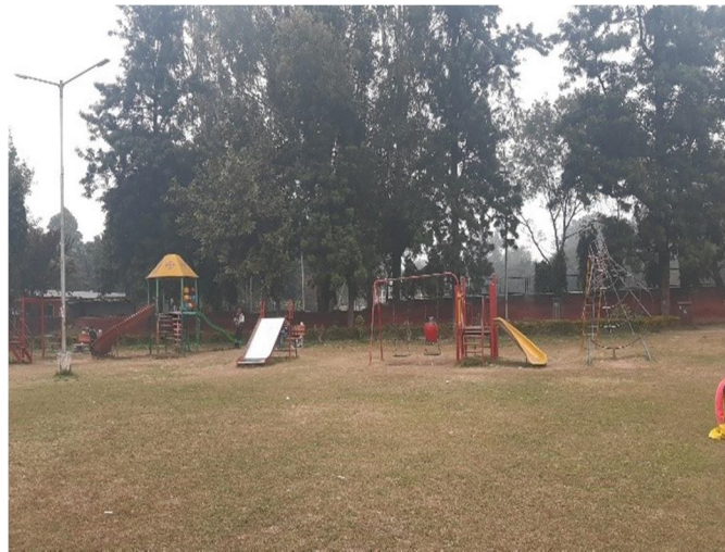
Fig. 7 Children Play Area; Nehru Park, Chandigarh

The community parks in both cities have similar functions and impacts on the neighbourhood. The final park studied is Parimal Garden in Ahmedabad. This is an urban park similar to Central Park. But Ahmedabad lacks a proper hierarchy of informal spaces, unlike planned cities but it does have many urban parks and open spaces. Ahmedabad is a result of Urban Sprawl; thus, the type of spaces differs from planned cities.