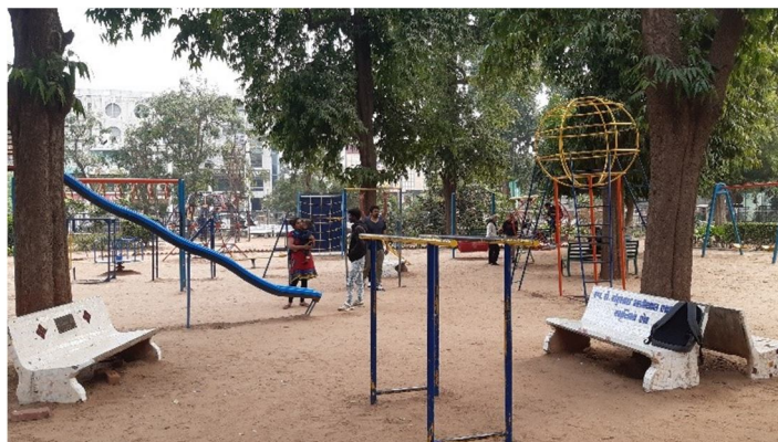
Fig. 8 Children Play Area; Parimal Garden, Ahmedabad

The clusters of the senior citizen were recognized predominantly near the entrance. When asked reason they mentioned it eases their access to the gates and reduces their travel time. This is a user group seen to spend time over 1 hour in the garden, seen reconnecting with friends (Fig 9).