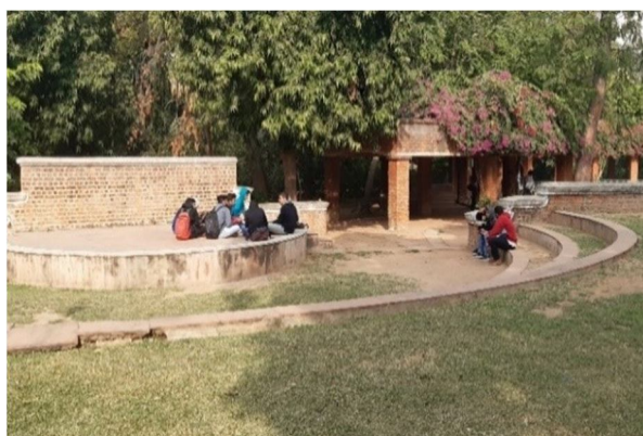
Fig. 10 Youth socialising at OAT; Parimal Garden, Ahmedabad

Interacting with the users gave the idea of the importance this garden holds to people of the neighbourhood. It's the focal point of their social interaction, a part of their daily life (Fig 10). The food stalls along the periphery of the garden have also become a crucial part of the neighbourhood identity as mentioned by the few users.