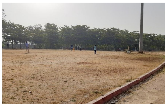
Fig. 2 Youth playing cricket; Central Park, Kharghar

These parks were at the neighbourhood level in Kharghar, but the next study was of Central Park, an urban park located across Sectors 23, 24 and 25 in Kharghar. Centrally located in Kharghar, it is accessible to all its residents with a small car ride. The park is mainly utilised for fitness, leisure, social and cultural events. The user group can be categorised into four; children, youth middle-aged and senior citizens. The park sees most of its visitors during the morning and evening hours. There are three entrances to the park, two along with parking and the main one with entrance complex which is usually closed but opened up for large scale social and cultural events. The garden is divided into sub-parts based on user occupancy. The open ground is usually filled with different age groups playing various sports. (Fig 2)