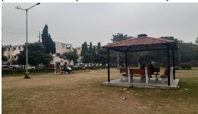
Fig. 5 Socialising at Gazebo seating; Nehru Park, Chandigarh

The Nehru Park is centrally located in Sector 22, is a part of the green belt concept used in Chandigarh City. The residents of the sector, walk around the neighbourhood and use the park for relaxation and socialization. The layout is recognised to be simple and easy to access with multiple entry points. The scale of the park determines its familiarity with the users.