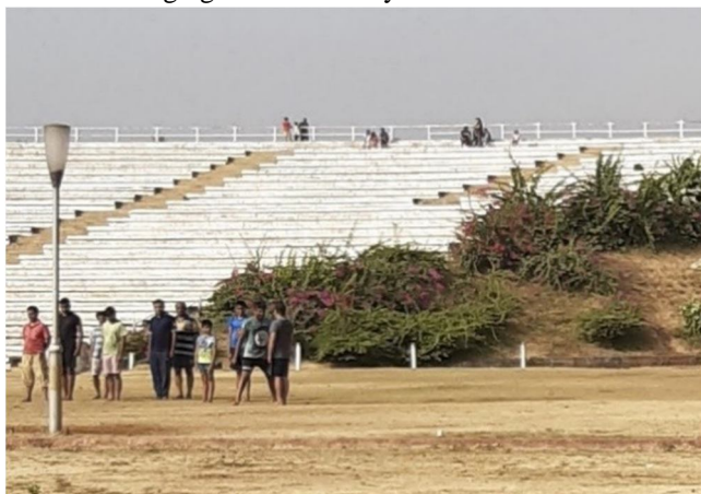
Fig. 4 Socialising at OAT; Central Park, Kharghar

Many cultural events have been hosted in the OAT of the park (Fig 4). The residents of Kharghar feel this is the cultural focal point of the zone and acts as an important factor in bringing the community closer.