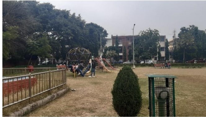
Fig. 6 Youth socialising; Nehru Park, Chandigarh