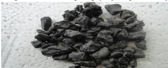
Fig.1 Plastic aggregates

Recycled plastic was used to replace coarse aggregate for making concrete specimens. Plastic collected from the disposal area were sorted to get the superior one. These were crushed into small fraction and then it was heated to a particular temperature. After extrusion the molten plastic was collected approximately. These plastic boulders were crushed to the size of aggregates. The process of grinding the plastic materials plays a significant role in the beginning by improving mechanical properties of concrete.