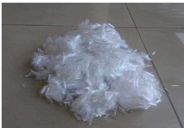
Fig.2 Polypropylene fiber

Polypropylene fiber is a synthetic fiber formed from a polypropylene melt. It has lower wear resistance. It displays good heat – insulating properties and is highly resistant to acids, alkalies, and organic solvents. Polypropylene is the lightest of all fibers and is lighter than water.