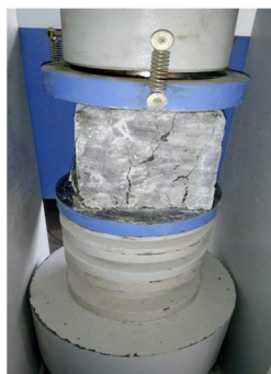
Fig.3 Compressive Strength