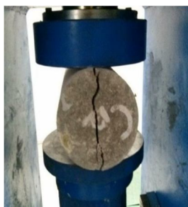
Fig.4Split tensile strength