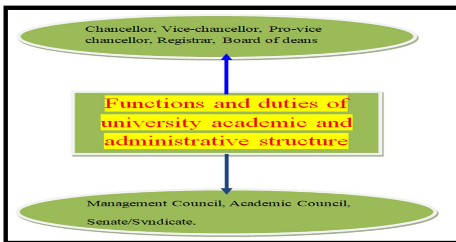
Fig. 1 indicates the functions and duties of different academic structure of universities

The research paper is the our key-efforts to put forward the importance of powers, functions and duties of associated with university academic structure including governor/chancellor, vice-chancellor, financial core system, management council, academic council and examination committee implemented by university to execute planning and development among university and colleges. It is our next academic paper to impart the knowledge of governing bodies associated with university observing bodies to society and college students.